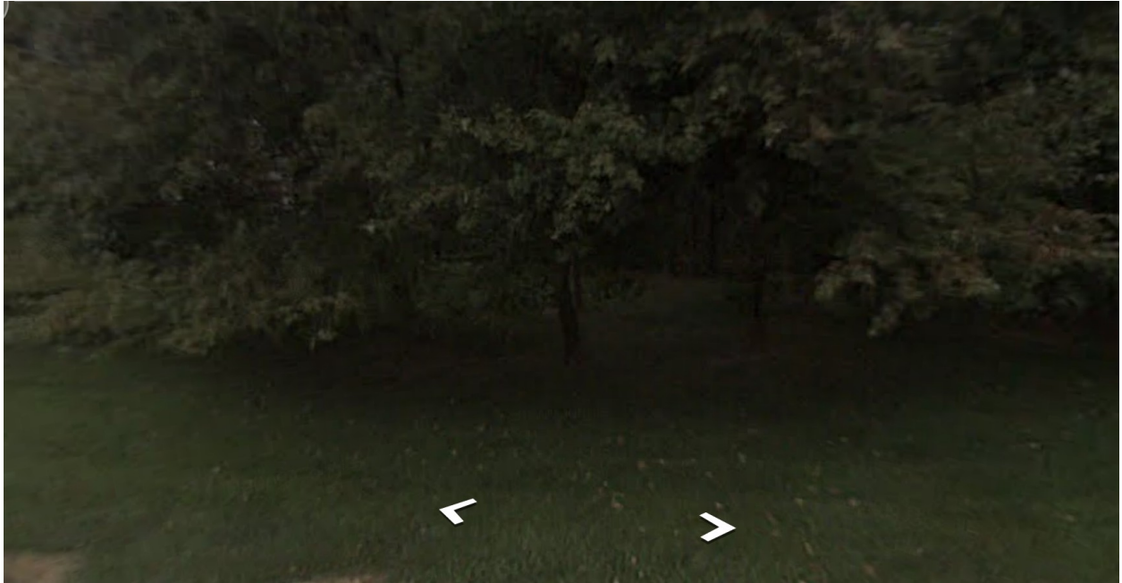
View from Adrienne's window