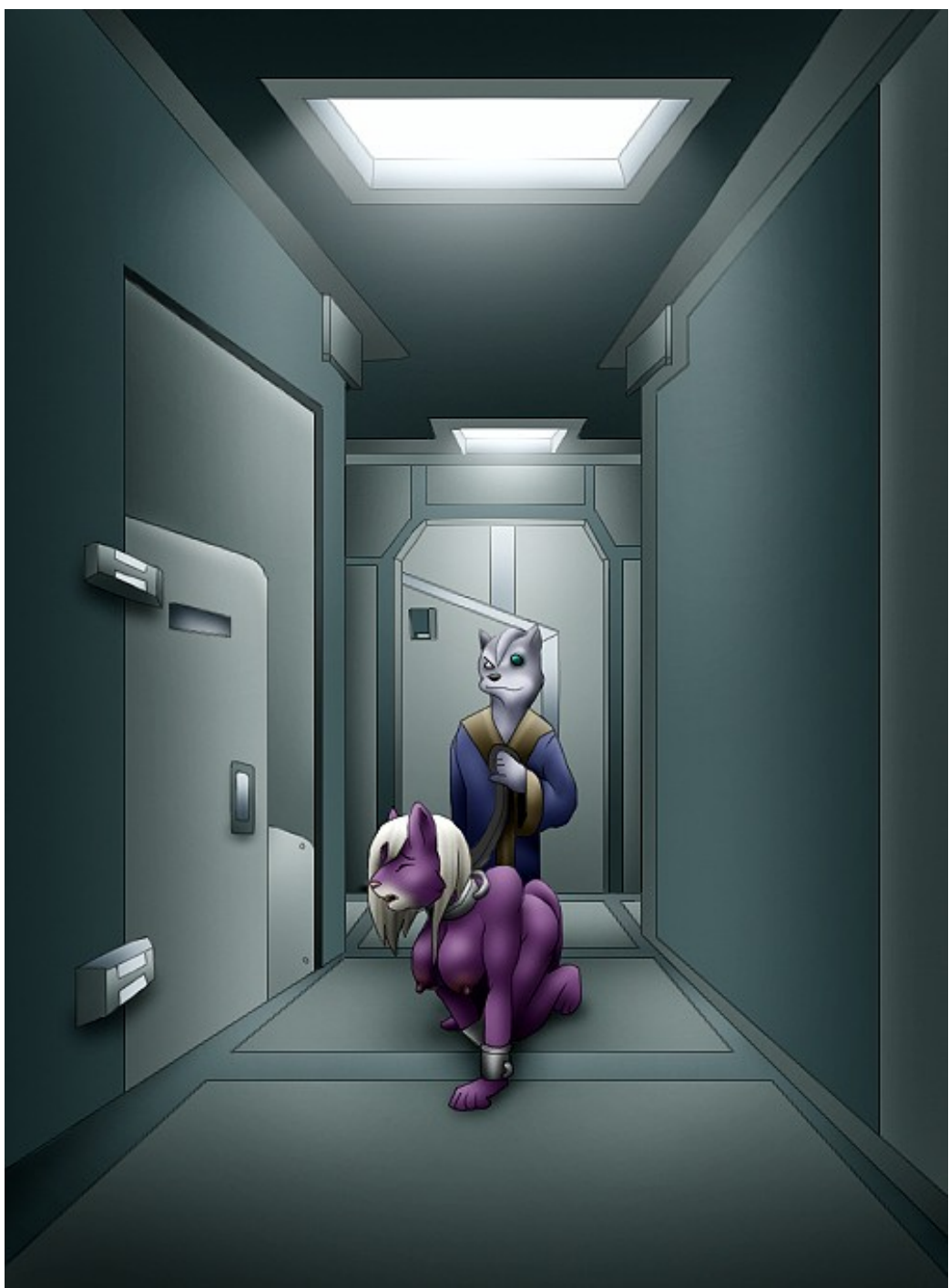
Interior to mimic in Wolf's quarters. Copy Wolf's eye piece. It's different from the game.