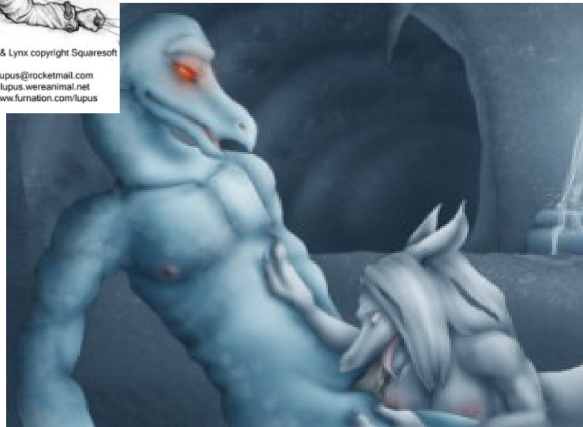
Levithan's wingless dragon form