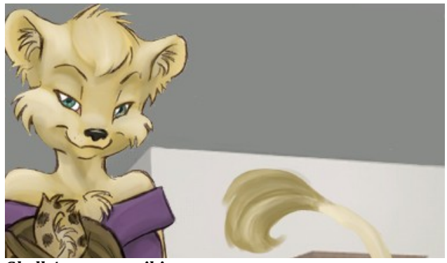
Shelly's correct tailtip