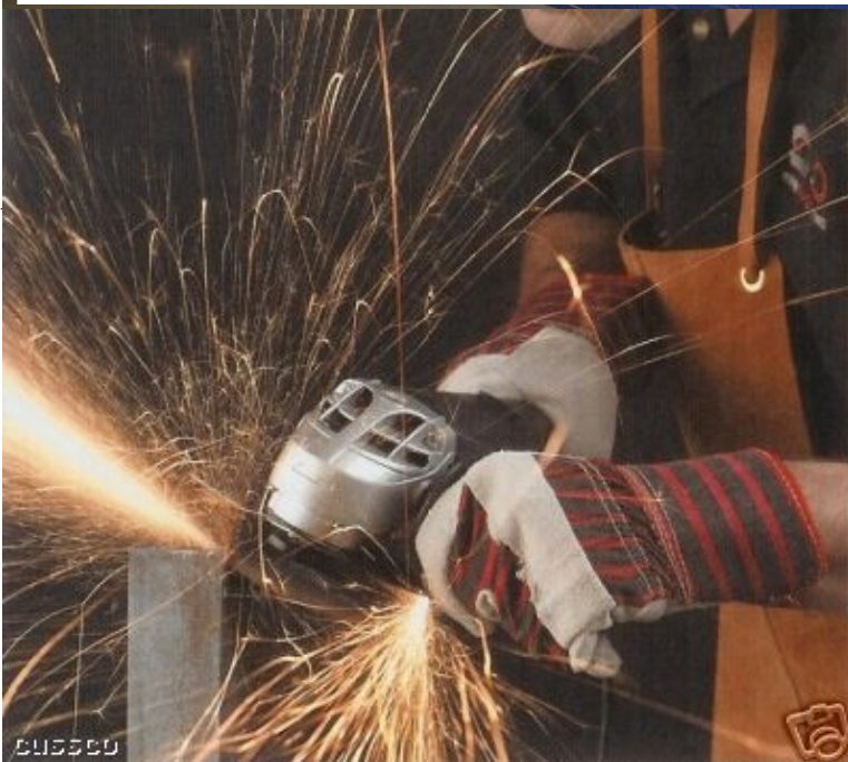
Example of spark patterns