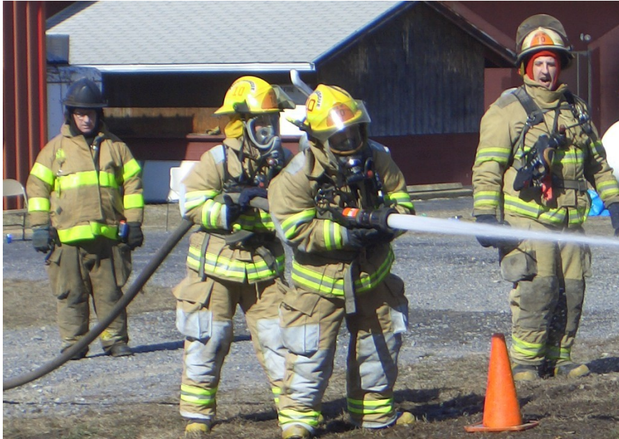
What the dalmatian is wearing. Use the two in the middle. Forget about the wide masks they're wearing in this one.