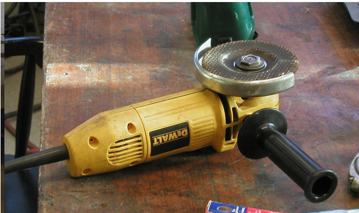
That's an angle grinder. the DeWalt is to be removed, not like it'd be visible.