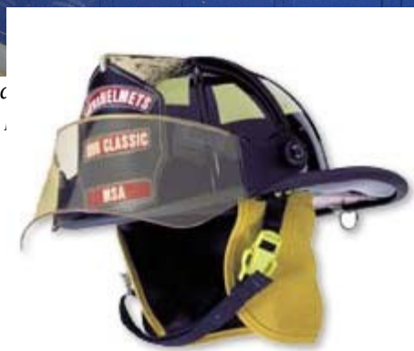
The dalmatian's helmet. Use the color scheme from the pic above.