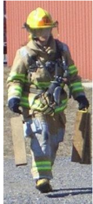
The lovely lady who the dalmatian represents. Use the helmet she's wearing.