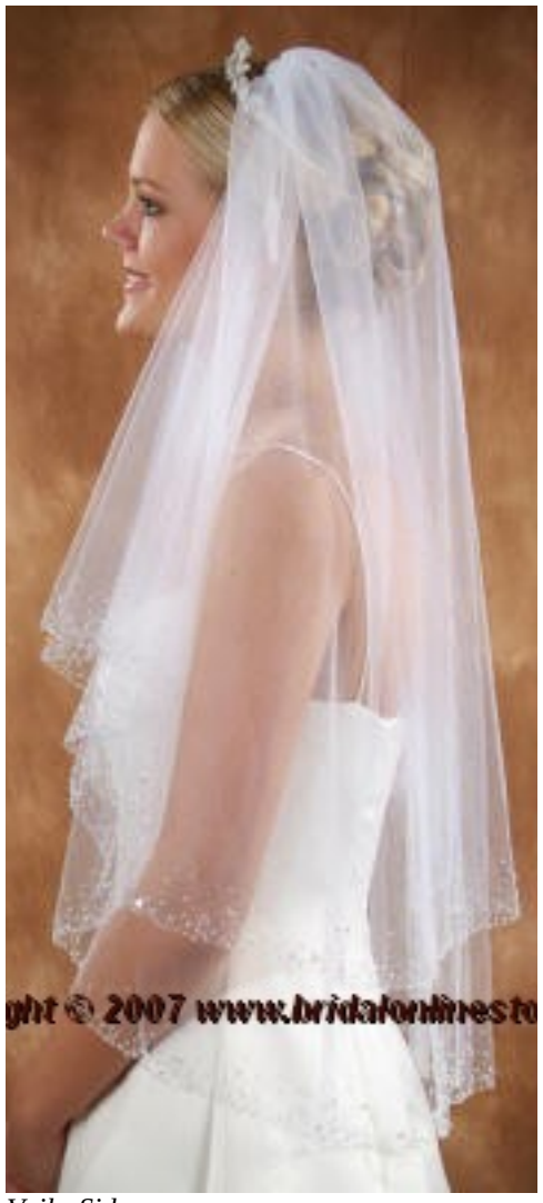
Veil - Side