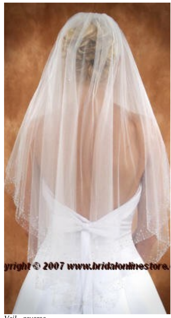
Veil - reverse