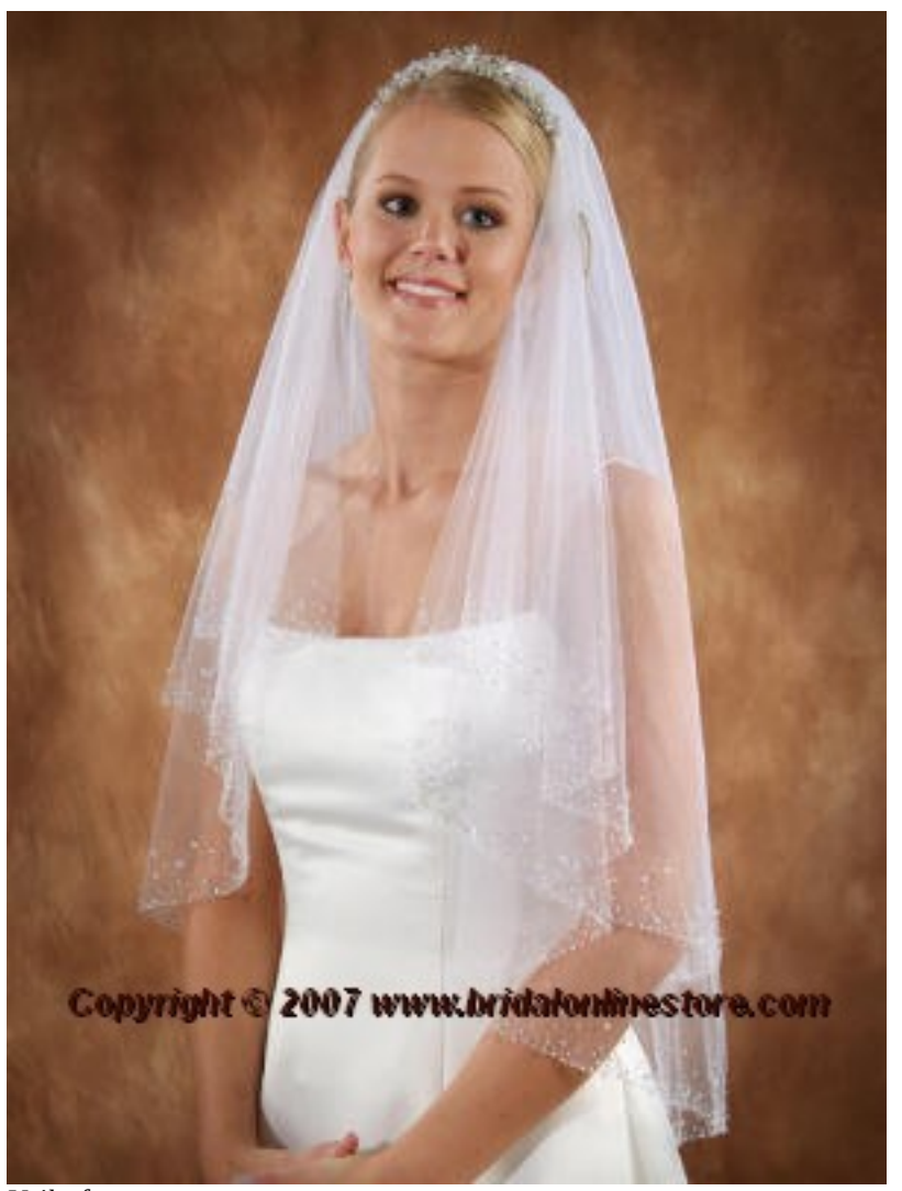
Veil - front