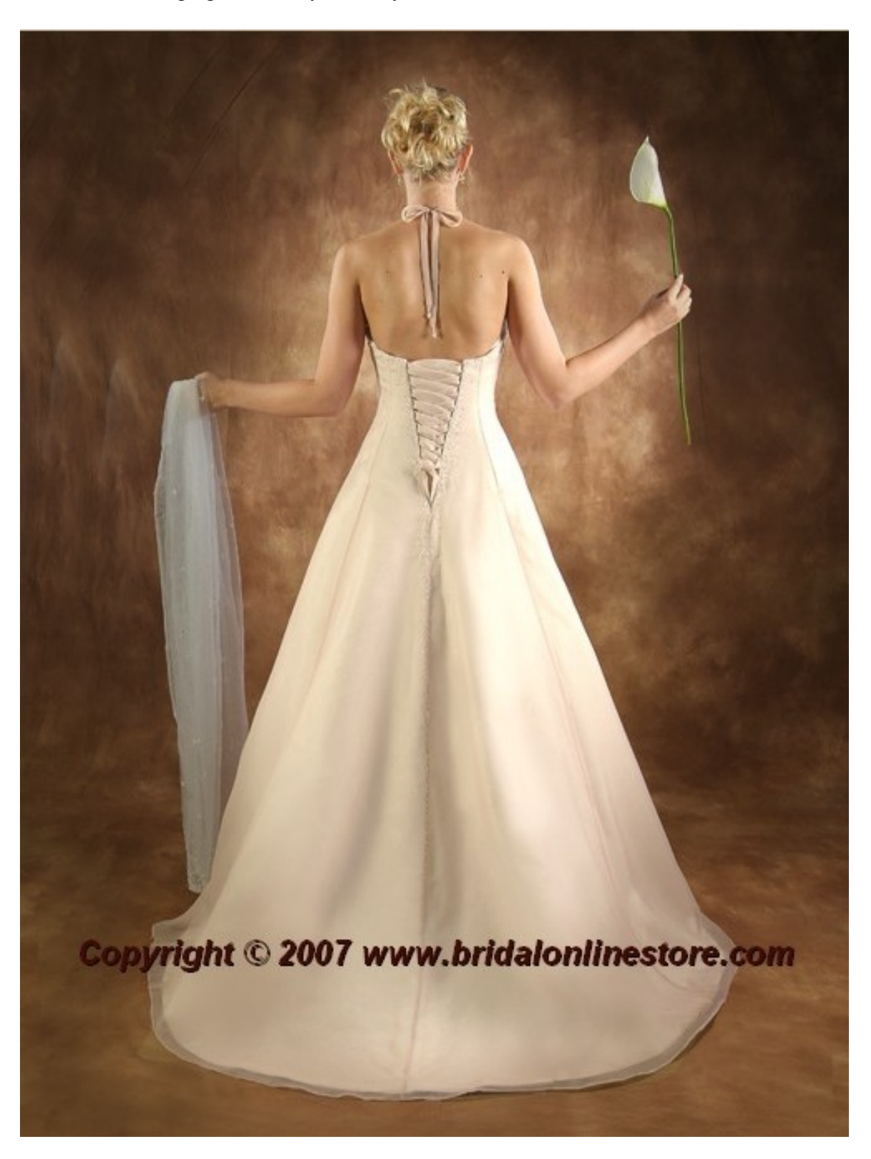
Page 5 of 10