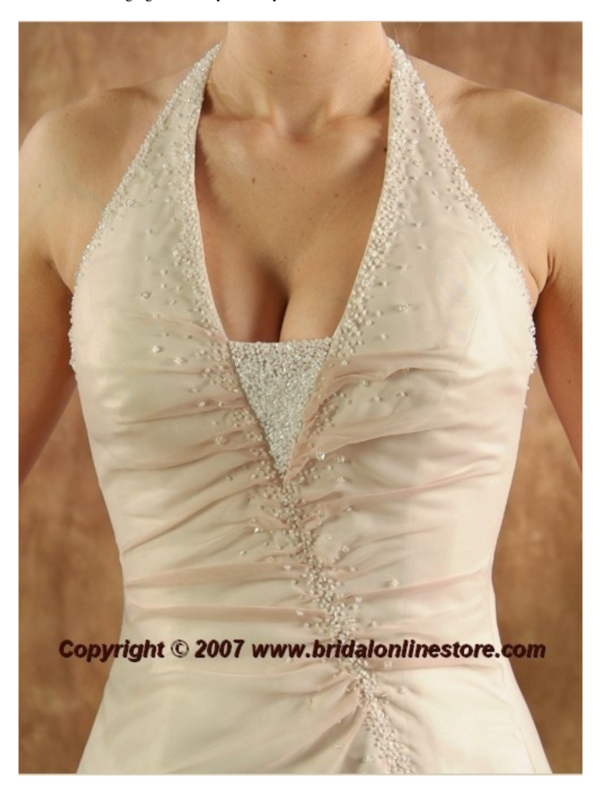
Page 6 of 10