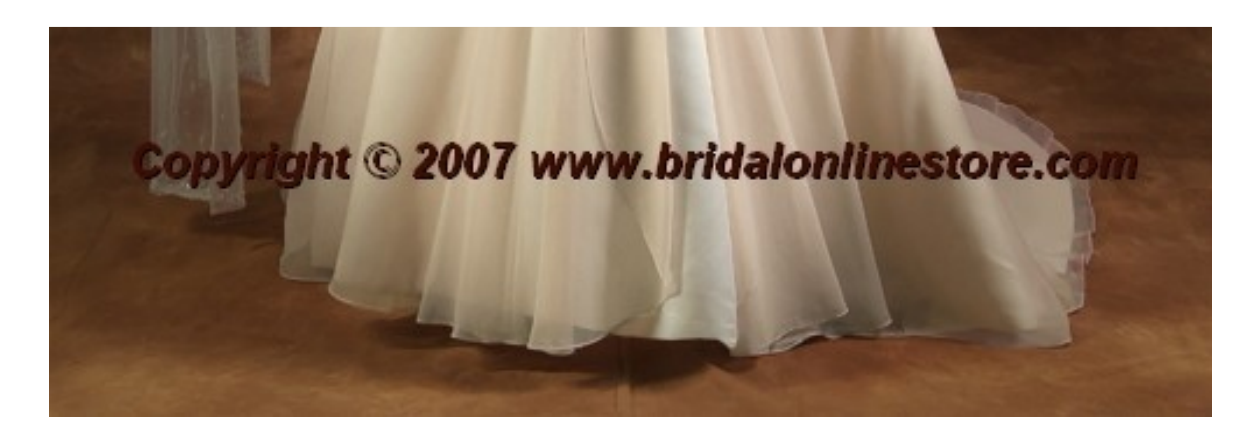
Page 3 of 10