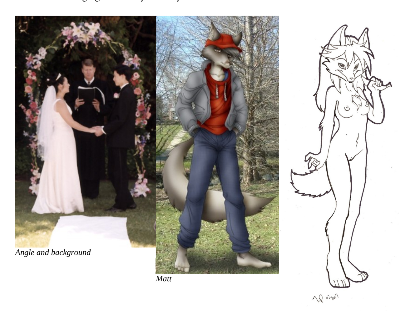
How Jessica looks not pregnant. Or not showing at the very least. Ignore the banana. S'a joke with the artist. Red/white ventral fur stripe and tailtip divider, and blackened eartip lines intentionally omitted. There are plenty of color references below.