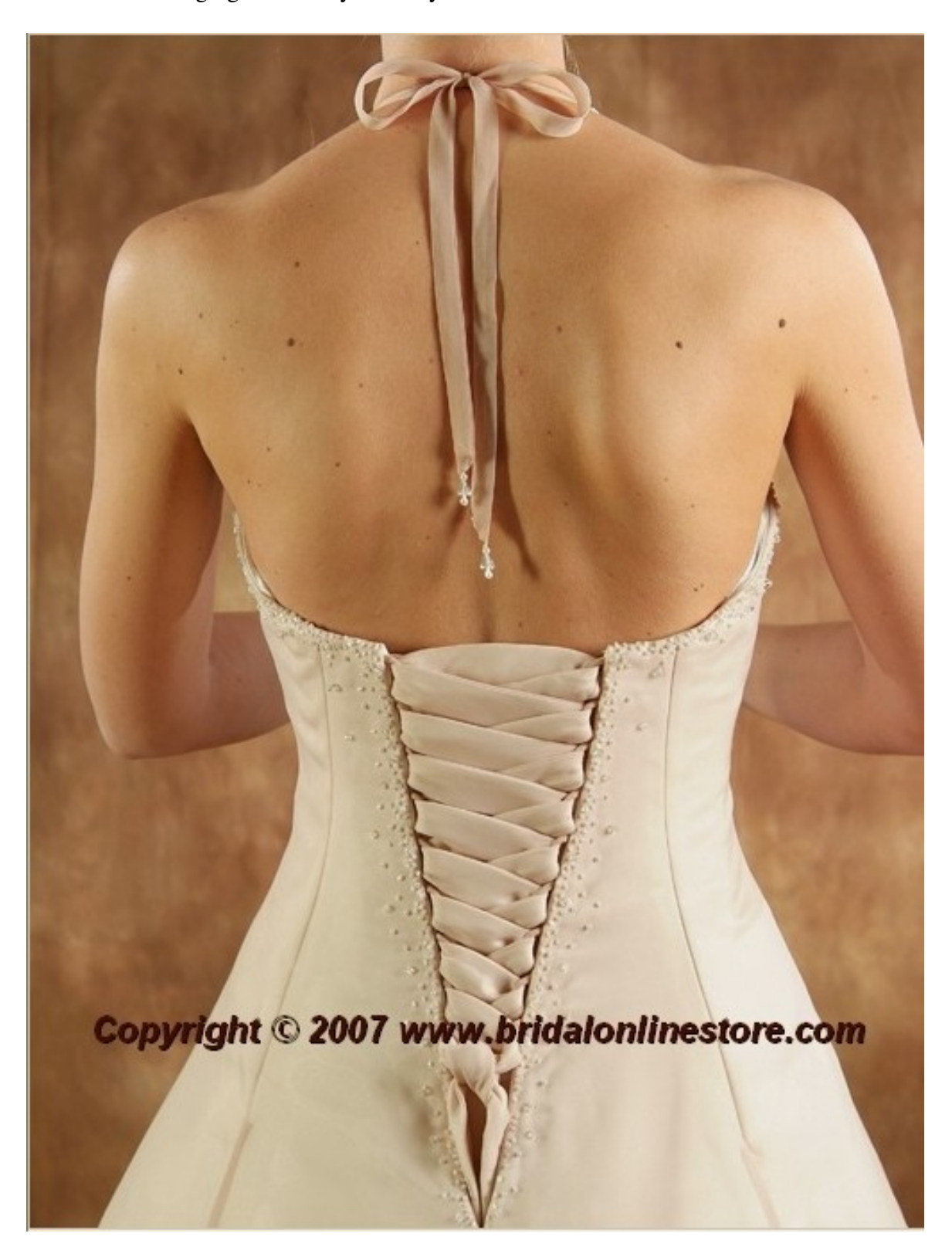
Page 7 of 10