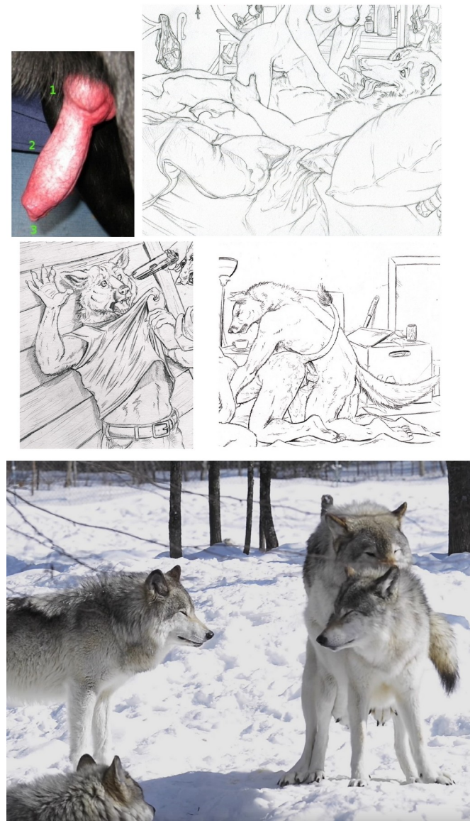
Page 8 of 10