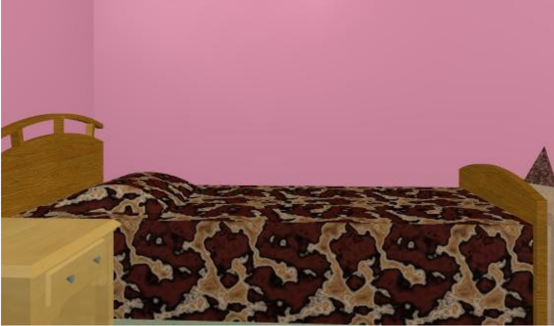
section of room to use. Pondering angle change.