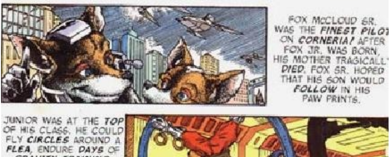
JUNIOR WAS AT THE TOP OF HIS CLASS, HE COULD FLY CIRCLES AROUND A FLEA, ENDURE DAYS OF GRAVITY TRAINING, RECITE THE CORNERIAN CONSTITUTION BACK-WARDS AND BELCH ON COMMAND, FOX SR. WAS JUSTLY PROUD.