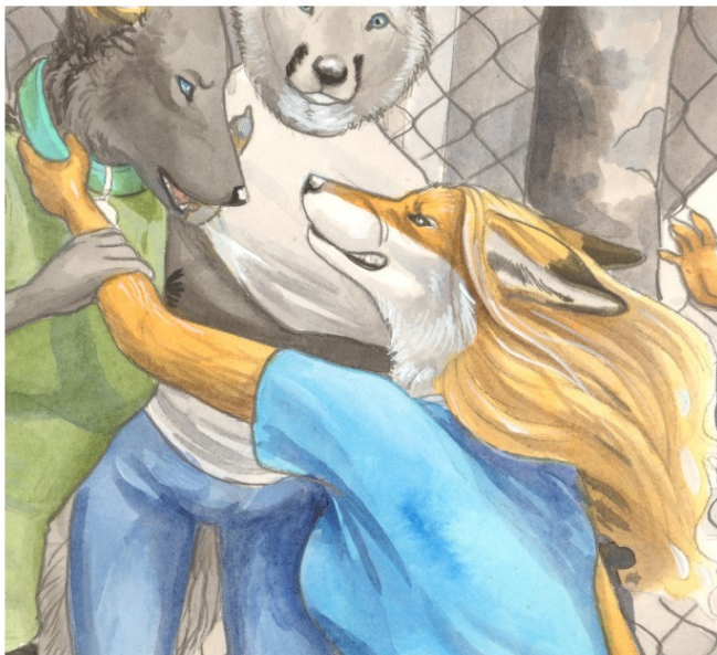
She's athletic. There's a loose shirt in this pic.

Species: Red Fox Height: 5'9" Weight: 132 pounds before pregnancy. 220 pounds at birth. Chest size: Full C cup before pregnancy. Build: Athletic with a little chub. Eye color: Brown Hair color: Blonde Other: White tailtip , black ear tips. Four fingers with thumb, with clawtips . Plantigrade feet with clawtips .