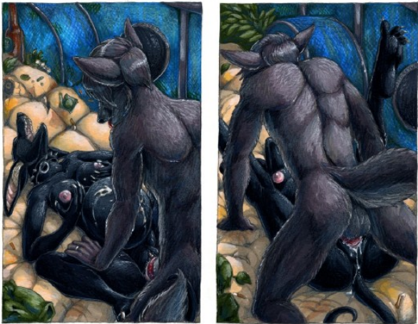
Van ref 2