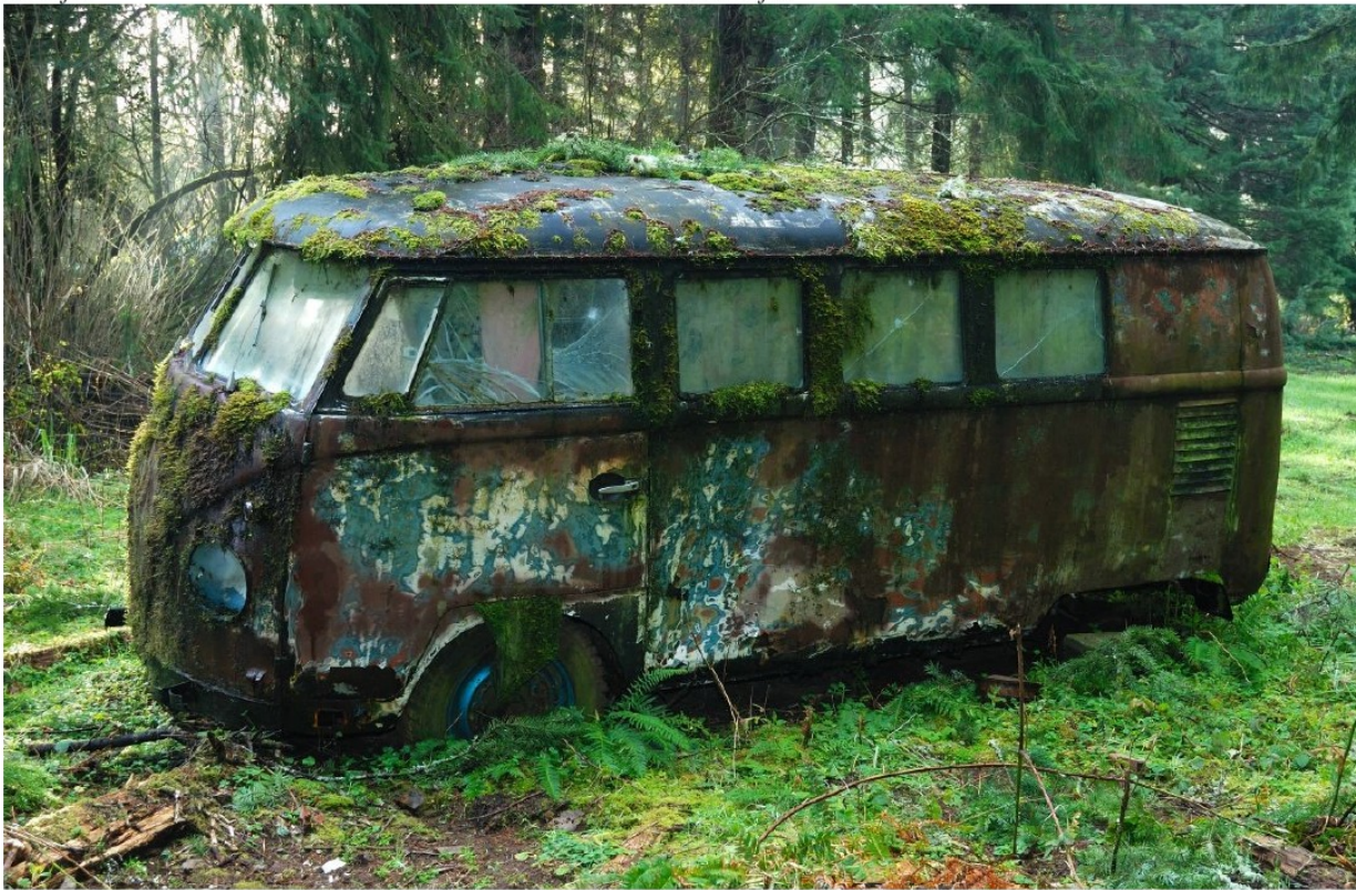
Van ref 3