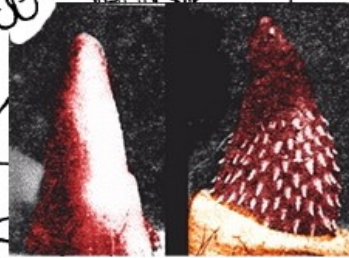
Cock spikes appear at climax