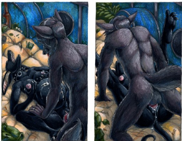
Van ref 2