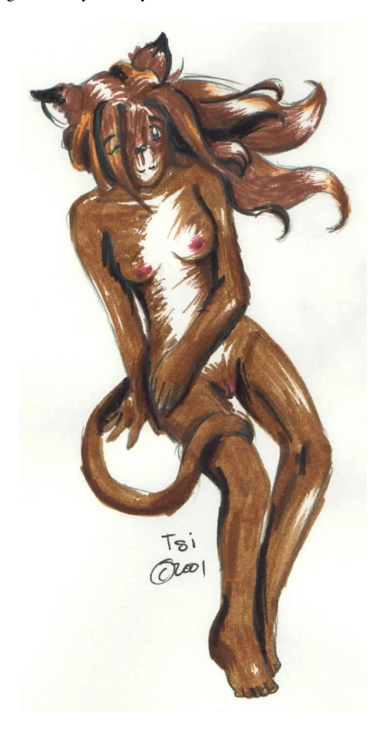
Page 3 of 7