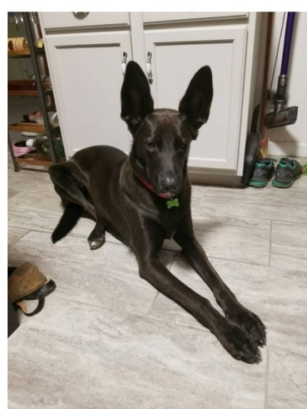
Page 2 of 3