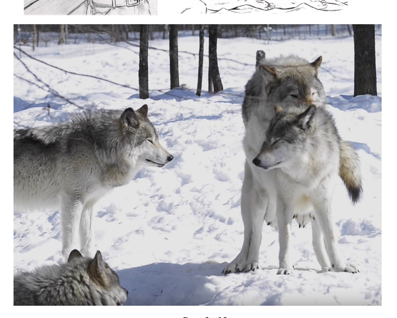
Page 3 of 3