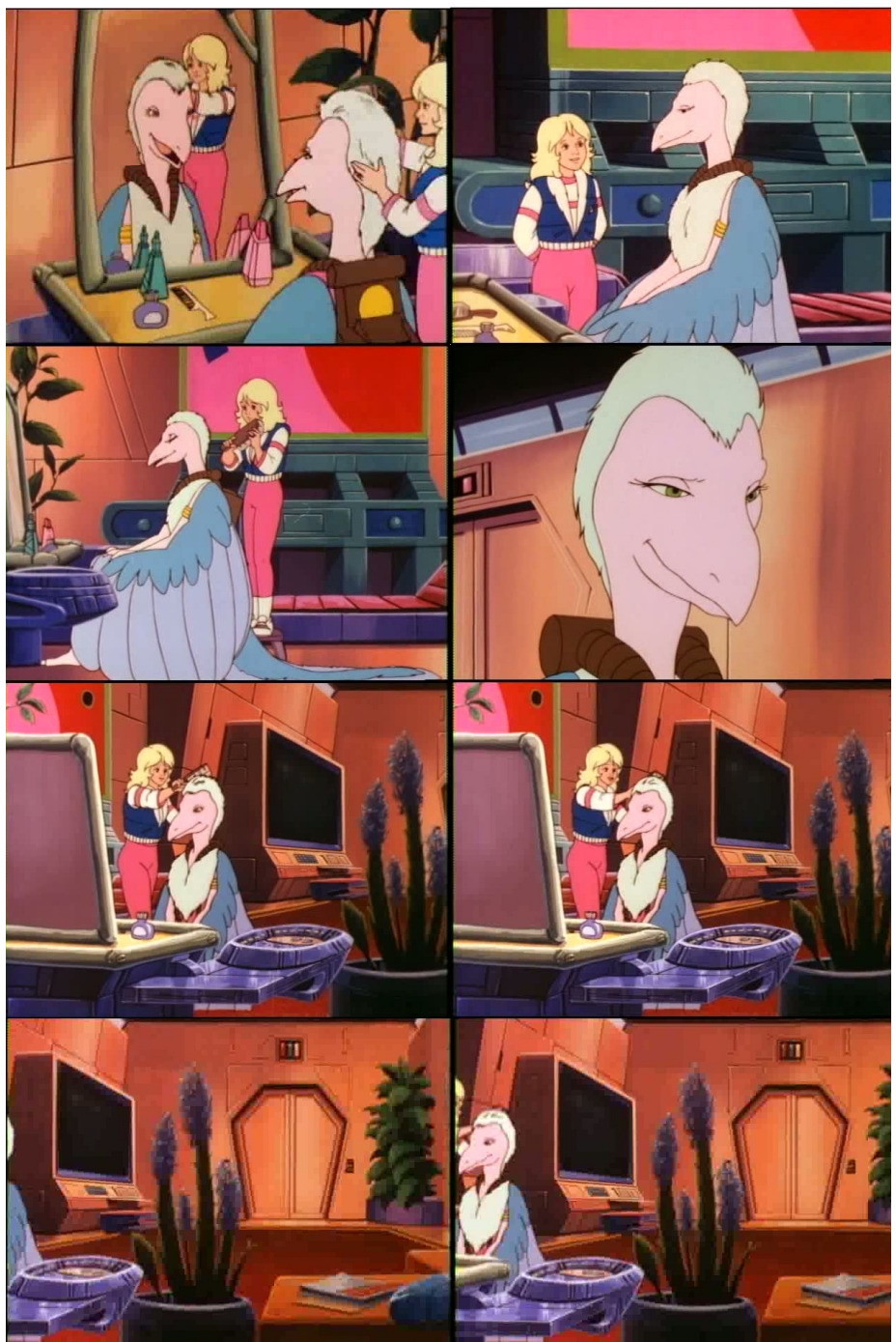
Page 10 of 14

This is Teryx's main room. The bed chamber is separate. Not a lot to work with, I know.