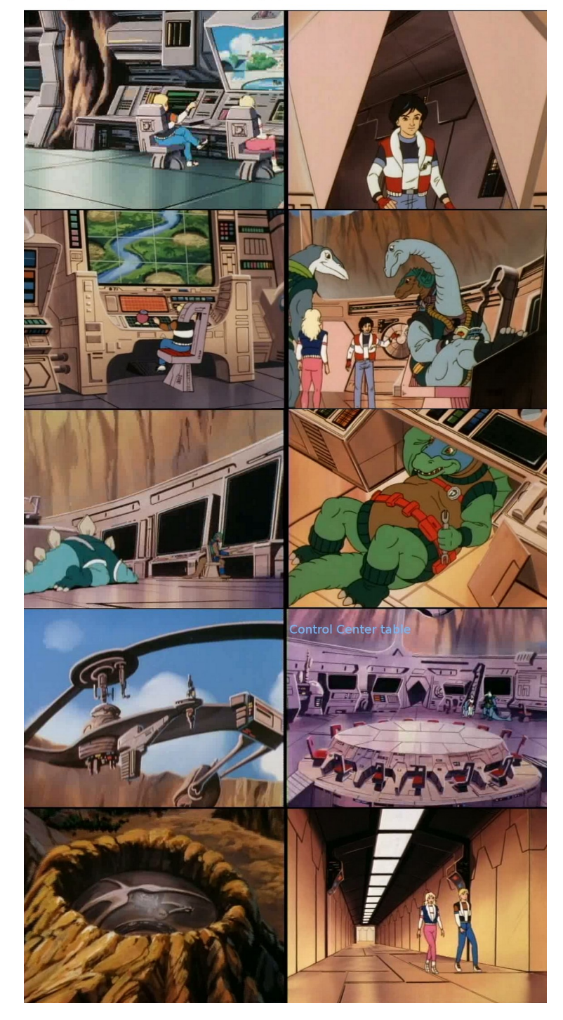
Page 5 of 14

LavaDome - Control Center The control center of LavaDome. The control center's main table is a pretty good stage for sexploits. If they're not fucking on the table, they're probably making a mess near one of the computers.