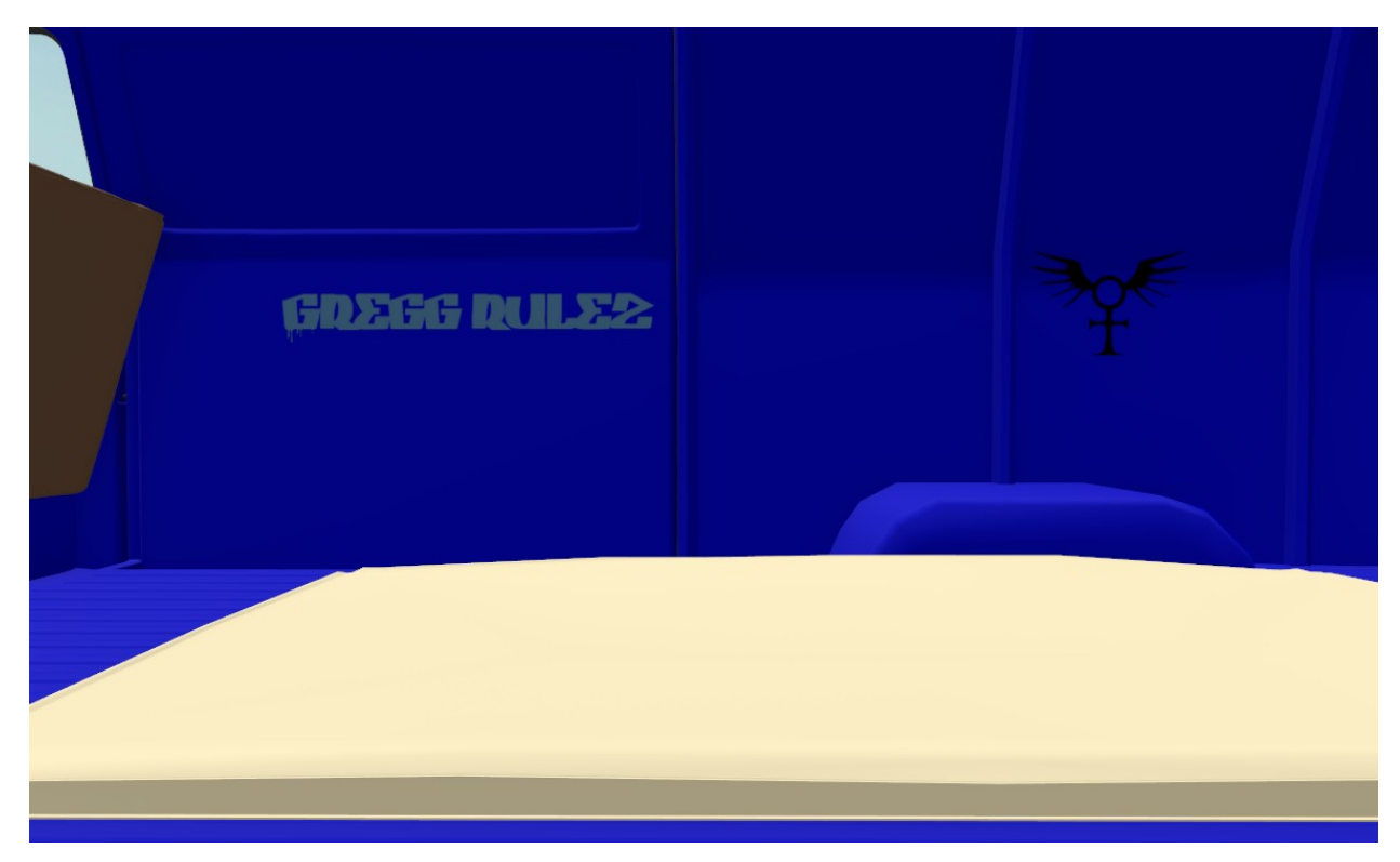
Figure 1: shaded view