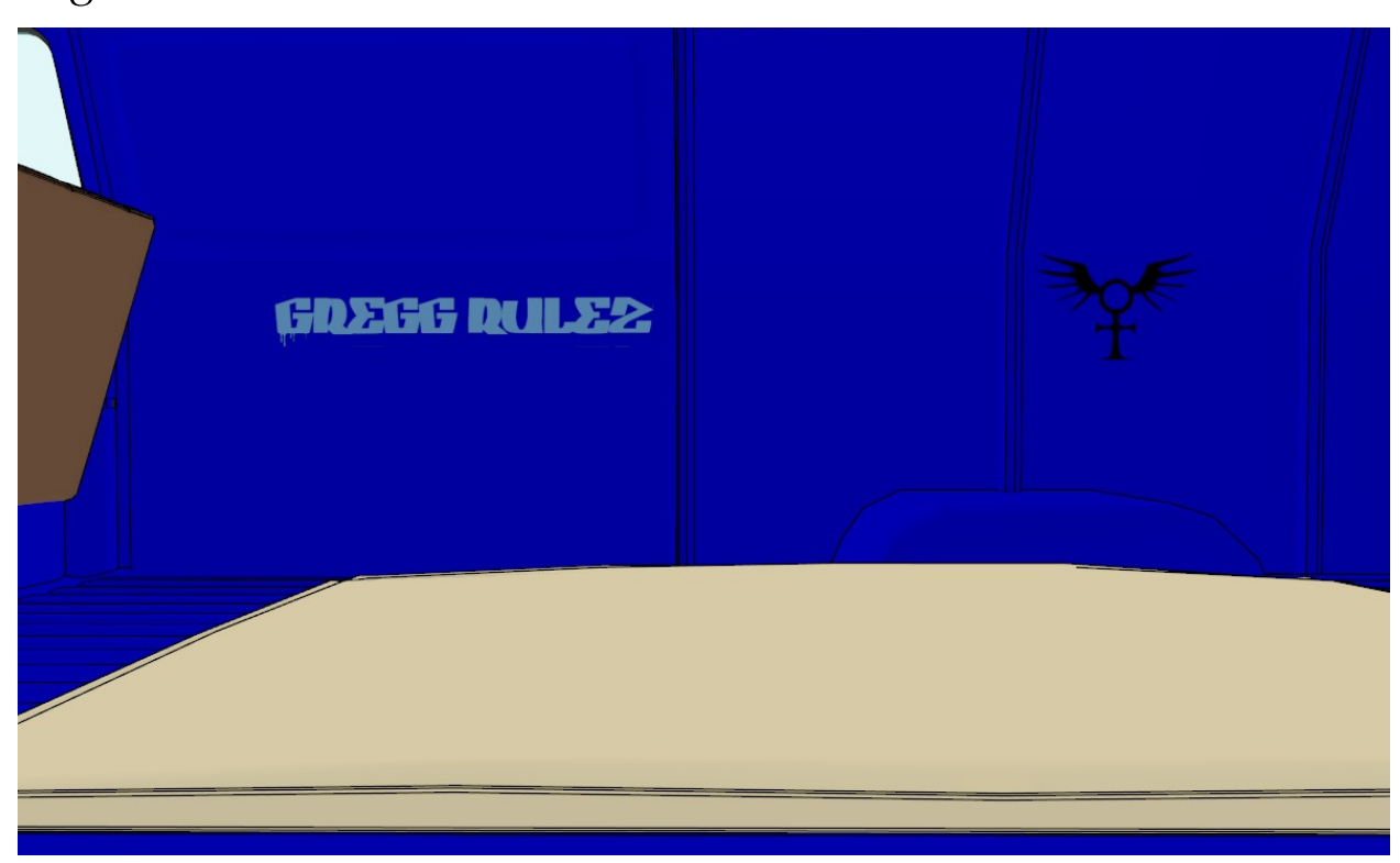
Figure 2: vector view