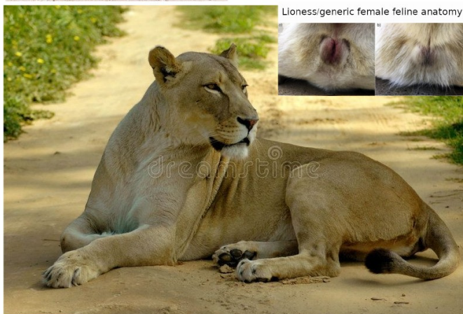
Lioness/generic female feline anatomy