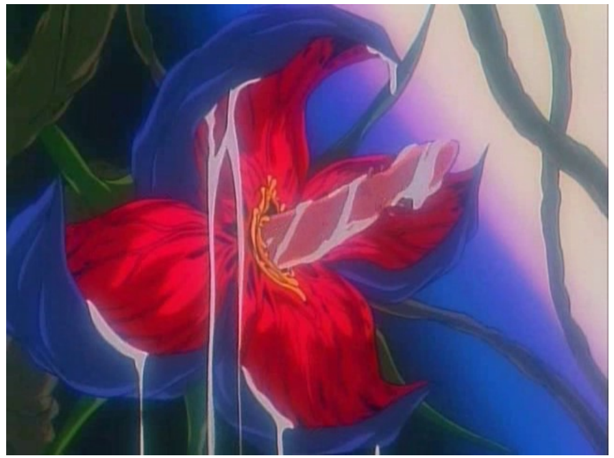
Page 2 of 7