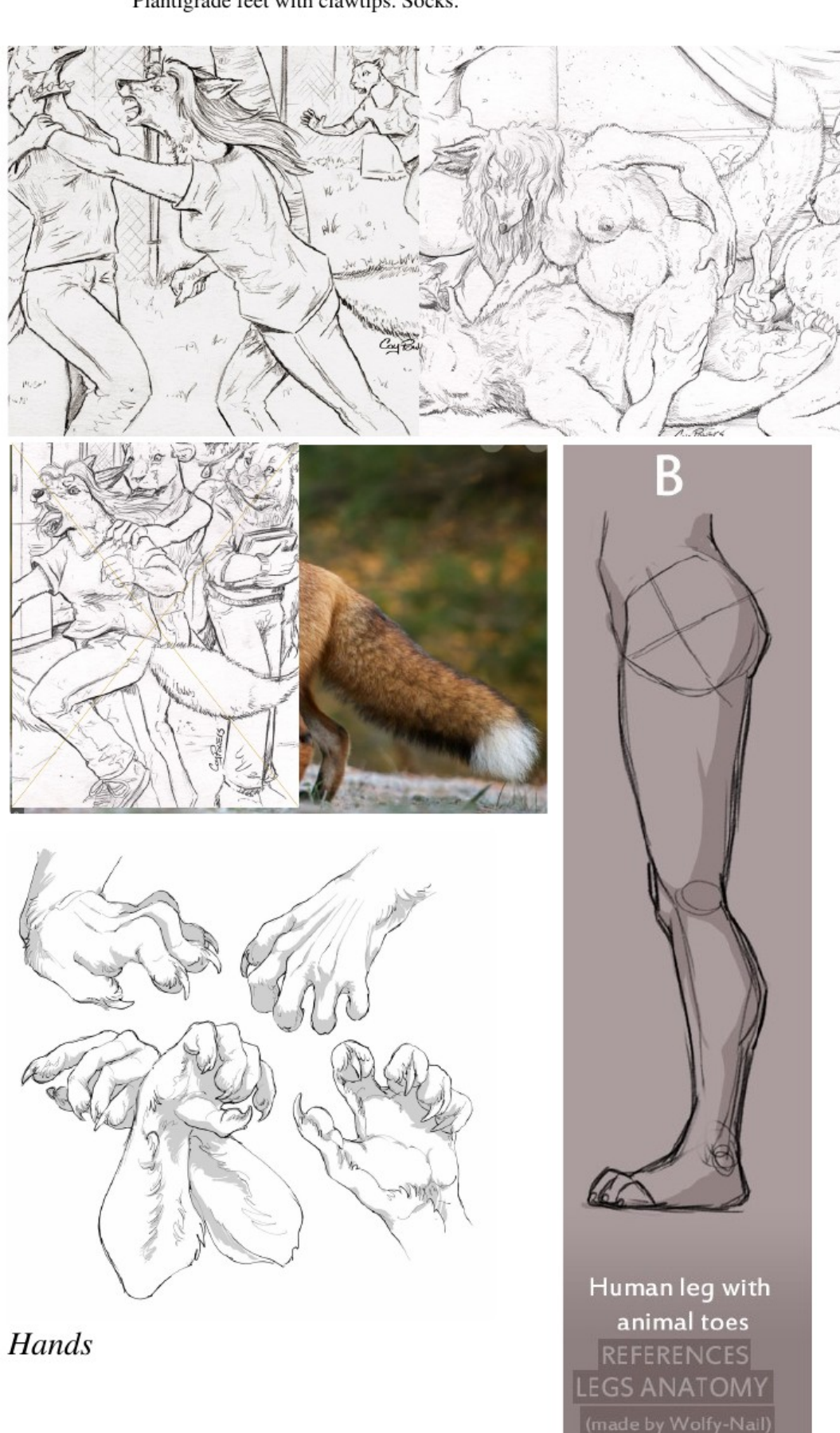
Page 4 of 8