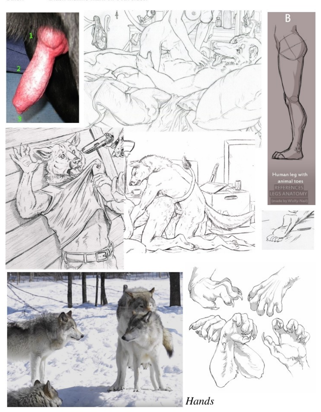
Example of a knotted cock. The knot forms at the base when climax is in progress.