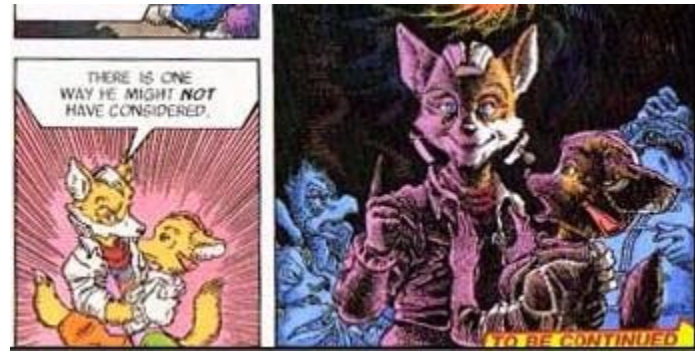
Fox and Fara size difference