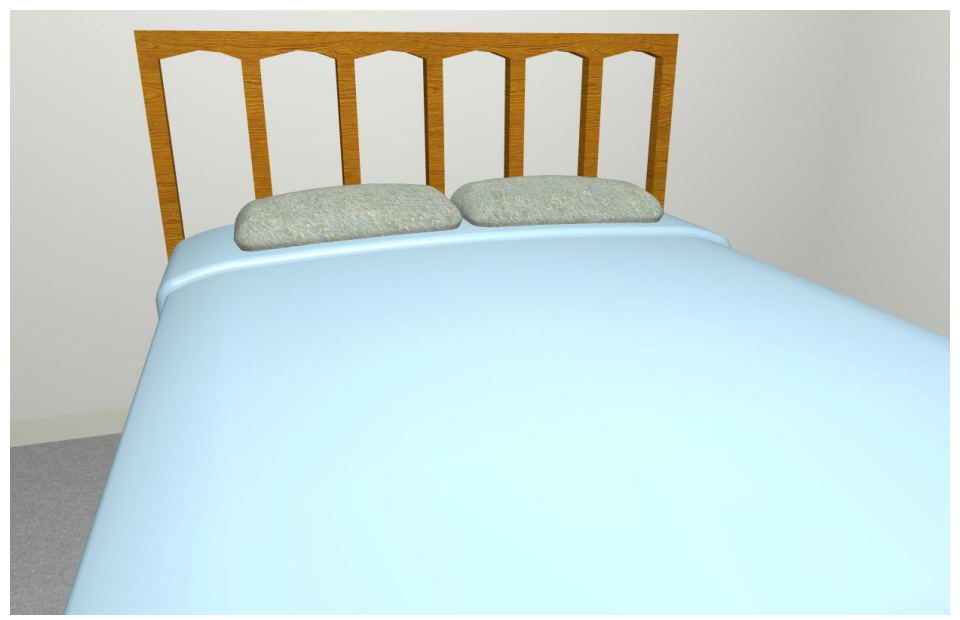
Angle & background to use. I whipped this render up of their home bedroom as they're not yet moved in. The program isn't perfect. >.> Sheets are obviously strewn. Pillows like in the aborted pic.