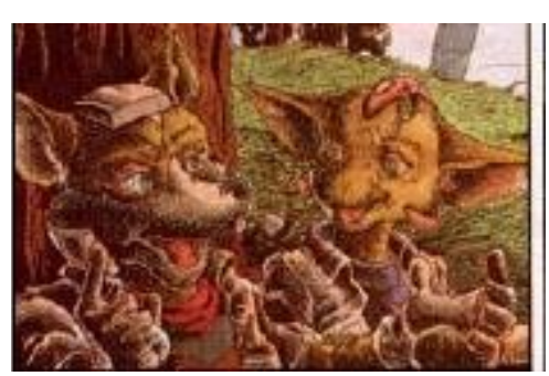
Fox and Fara 2