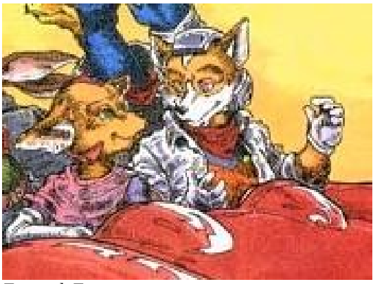
Fox and Fara