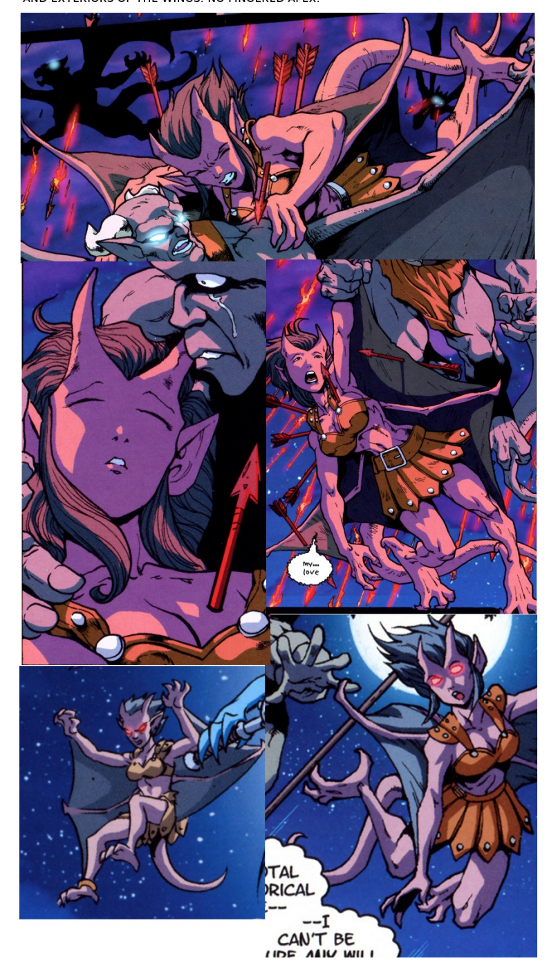
Page 2 of 4

NAME: SACRIFICE CLAN: SCATTERED (997) HEIGHT: 5'5" CHEST: LIGHT C CUP WITH BLACK NIPPLES CLAWS: THREE FINGERS + ONE THUMB EYES: BLACK PUPILS WITH WHITE FILL POWER EYES: RED WINGS: FOR COLORING PURPOSES, NOTE THE DIFFERING COLORS ON THE INTERIORS AND EXTERIORS OF THE WINGS. NO FINGERED APEX.