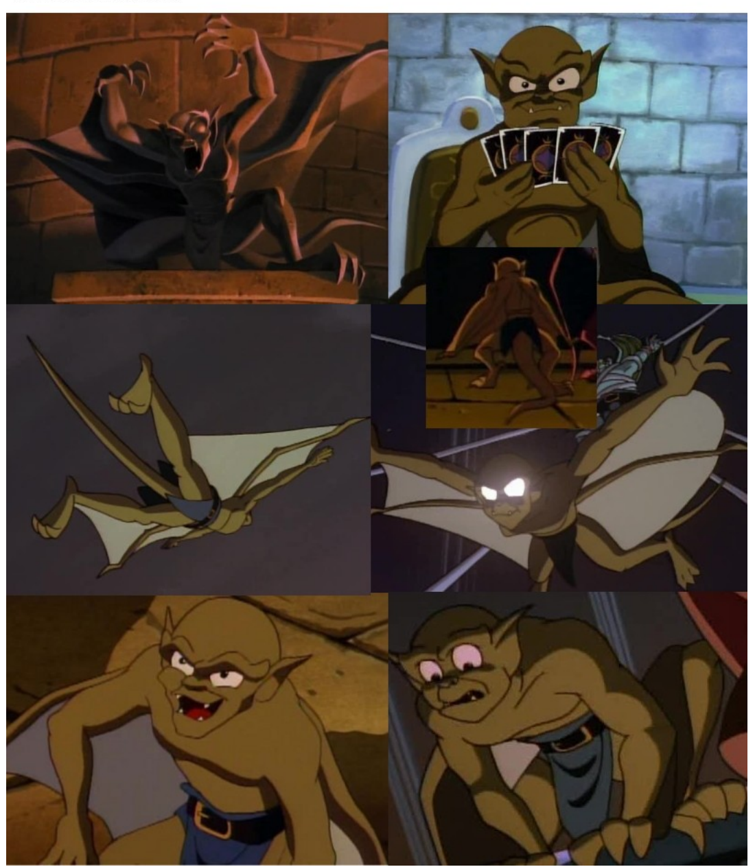
Page 3 of 5