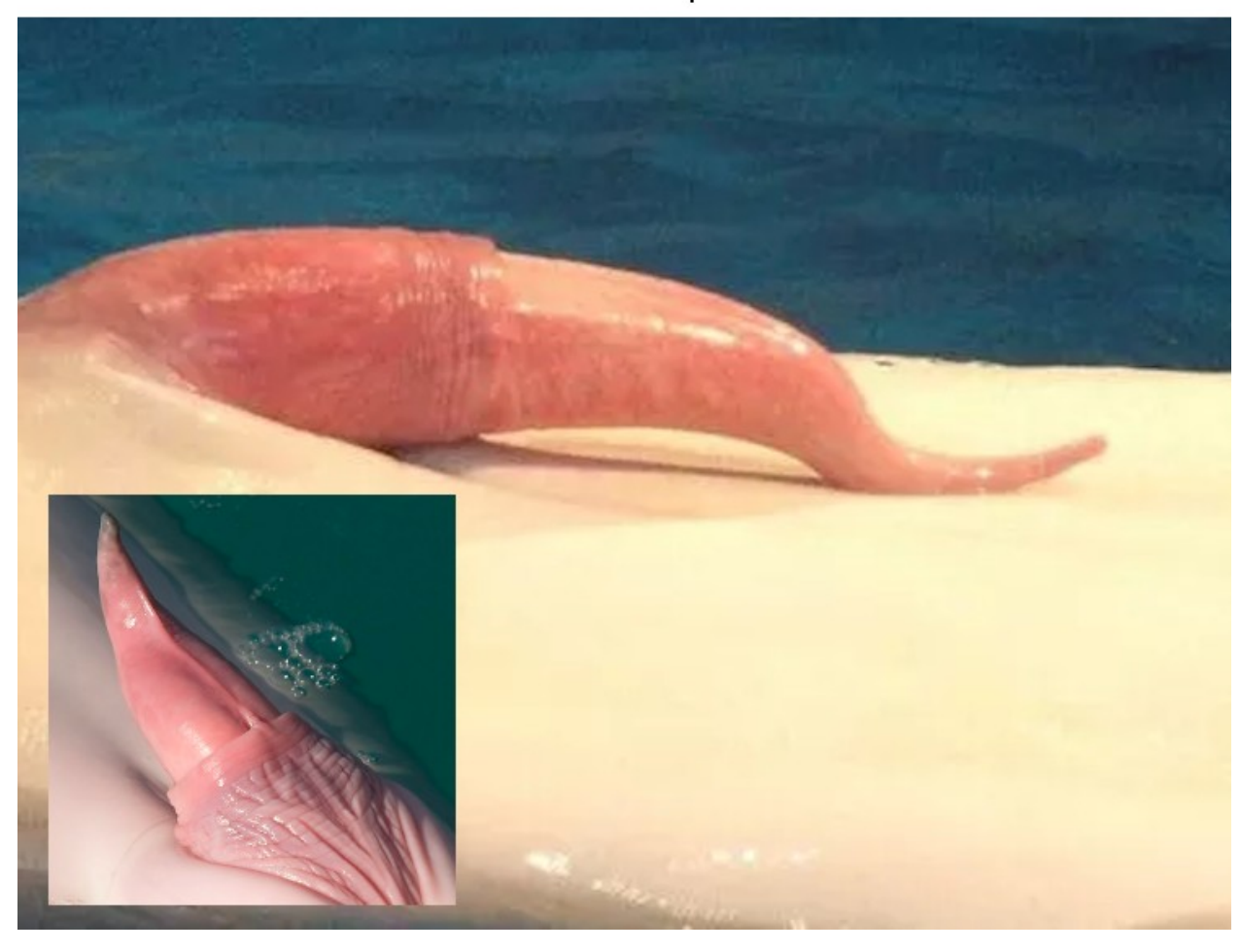
Page 3 of 3